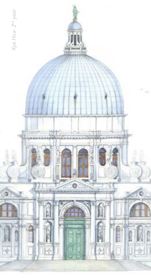
Xye Hua - 2 nd year