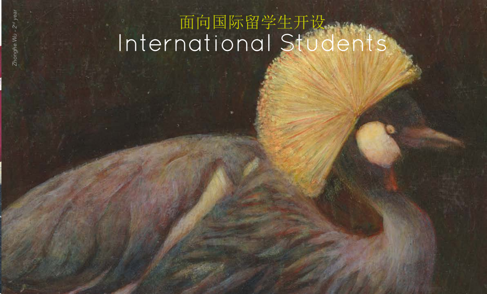
Zhonghe Wu - 2 nd year