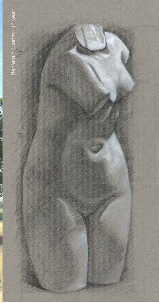
Benjamin Gastini - 1 st year